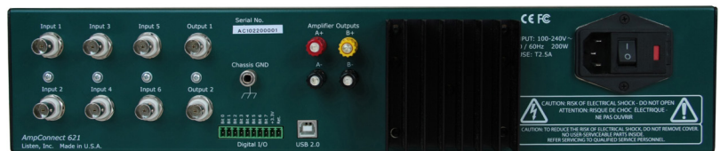
AmpConnect 621 Rear View

Without rack mounting flanges: 17"/432mm wide x 3.5"/90mm (2-U) high x 11.5"/292mm deep Weight: 7.275 lbs (3.3kg) approx. Power: 100-240 VAC 50/60 Hz, 140 Watts