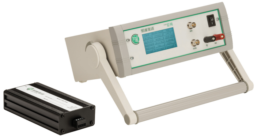
DCC-1448 (right) and PQC-3048 (left) Interfaces